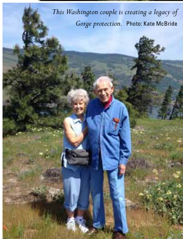
This Washington couple is creating a legacy of Gorge protection.